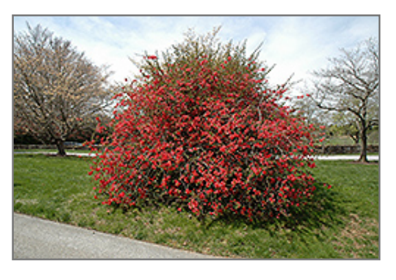
Texas Scarlet Flowering Quince in bloom

This is a high maintenance shrub that will require regular care and upkeep, and should only be pruned after flowering to avoid removing any of the current season's flowers. Gardeners should be aware of the following characteristic(s) that may warrant special consideration;