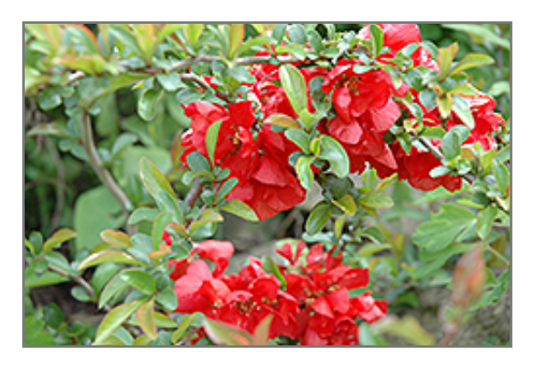
Texas Scarlet Flowering Quince flowers

8424 Farley St. Overland Park, KS 66212 913.642.6503