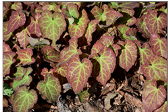
Froehnleiten Bishop's Hat foliage