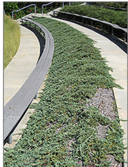
Blue Carpet Juniper