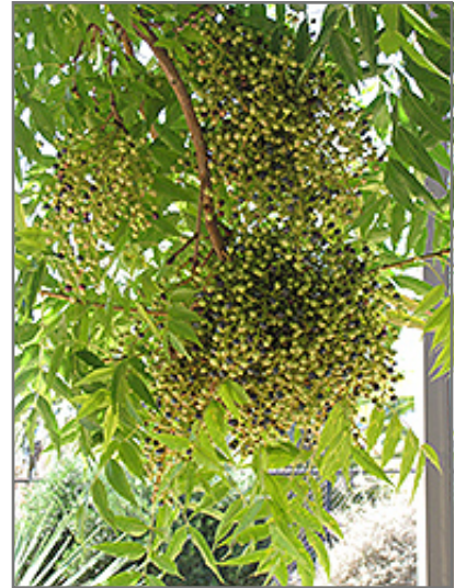
Chinese Pistache fruit

This tree should only be grown in full sunlight. It is very adaptable to both dry and moist growing conditions, but will not tolerate any standing water. It is not particular as to soil type or pH. It is highly tolerant of urban pollution and will even thrive in inner city environments. This species is not originally from North America.