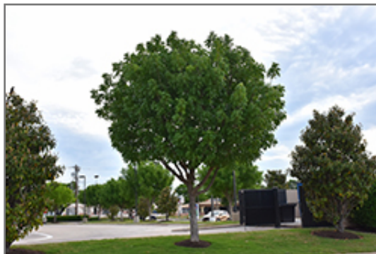
Chinese Pistache