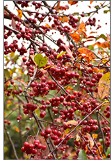
Prairifire Flowering Crab fruit

This tree should only be grown in full sunlight. It prefers to grow in average to moist conditions, and shouldn't be allowed to dry out. It is not particular as to soil type or pH. It is highly tolerant of urban pollution and will even thrive in inner city environments. This particular variety is an interspecific hybrid.