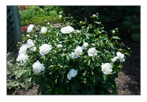
Festiva Maxima Peony in bloom

8424 Farley St. Overland Park, KS 66212 913.642.6503