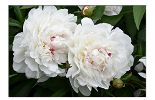
Festiva Maxima Peony flowers