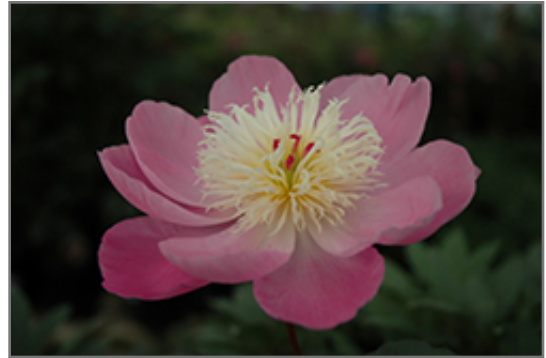
Edulis Superba Peony flowers