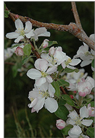
Pink Lady Apple flowers