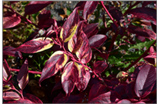
Rainbow Fetterbush in fall

Rainbow Fetterbush will grow to be about 5 feet tall at maturity, with a spread of 6 feet. It tends to fill out right to the ground and therefore doesn't necessarily require facer plants in front, and is suitable for planting under power lines. It grows at a medium rate, and under ideal conditions can be expected to live for approximately 20 years.