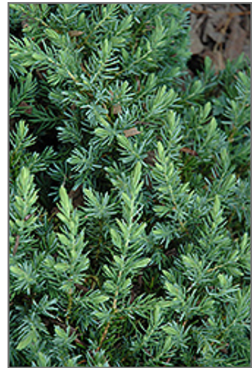
Blue Pacific Shore Juniper foliage