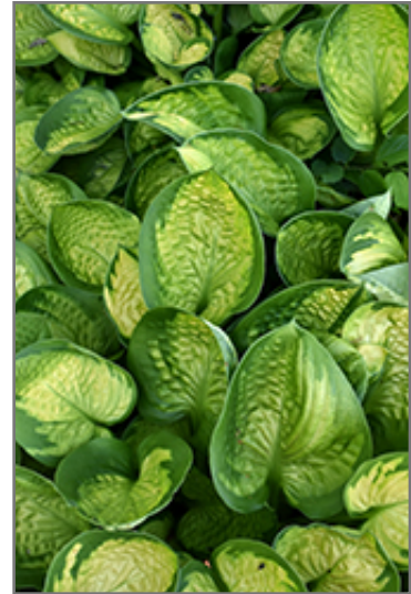
Rainforest Sunrise Hosta foliage

Rainforest Sunrise Hosta is recommended for the following landscape applications;