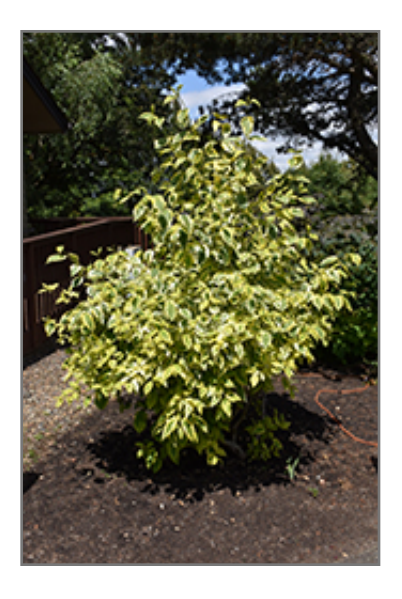
Hedgerows Gold Variegated Red-Twig Dogwood