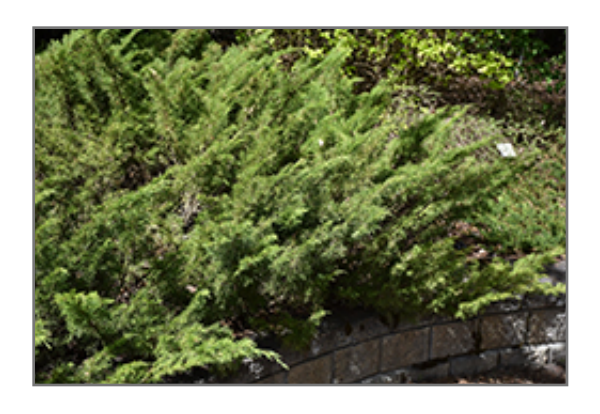
Skandia Juniper

Skandia Juniper is recommended for the following landscape applications;