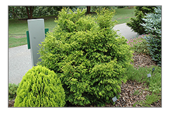
Lemon Twist Hinoki Falsecypress