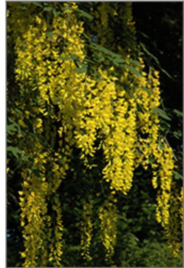
Weeping Laburnum flowers