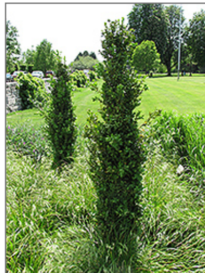
Graham Blandy Boxwood