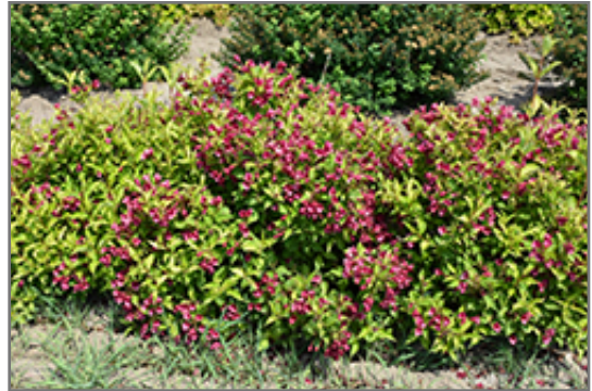
Ghost Weigela in bloom

This shrub should only be grown in full sunlight. It prefers to grow in average to moist conditions, and shouldn't be allowed to dry out. It is not particular as to soil type or pH. It is highly tolerant of urban pollution and will even thrive in inner city environments. This is a selected variety of a species not originally from North America.