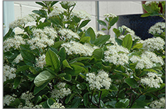
Winterthur Viburnum flowers

This is a relatively low maintenance shrub, and should only be pruned after flowering to avoid removing any of the current season's flowers. It is a good choice for attracting birds to your yard, but is not particularly attractive to deer who tend to leave it alone in favor of tastier treats. It has no significant negative characteristics.