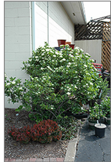
Winterthur Viburnum in bloom