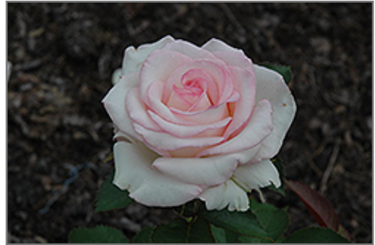
Moonstone Rose flowers

Moonstone Rose is recommended for the following landscape applications;