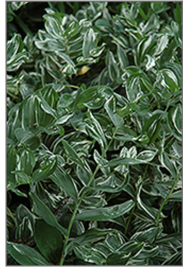
Variegated Solomon's Seal foliage

Attractive variegated leaves is what sets this variety apart; elegant nodding silky white blooms in late spring above mounded foliage is attractive all season long makes this a great choice for the shaded area