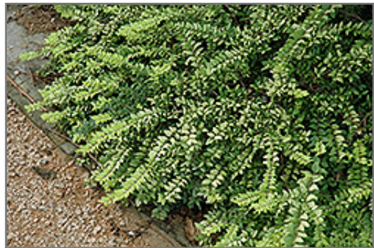
Edmee Gold Honeysuckle