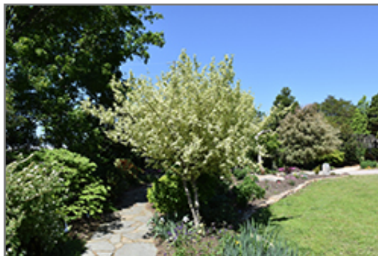
Variegated Cornelian Cherry Dogwood

8424 Farley St. Overland Park, KS 66212 913.642.6503