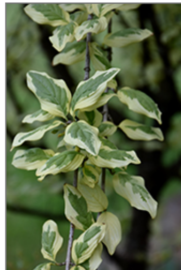
Variegated Cornelian Cherry Dogwood foliage

Variegated Cornelian Cherry Dogwood is recommended for the following landscape applications;