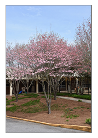
Prairie Pink Flowering Dogwood in bloom

830 W Liberty Dr. Liberty, MO 64068 816.781.0001