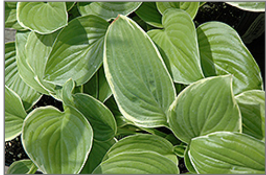
Frozen Margarita Hosta foliage

Frozen Margarita Hosta is recommended for the following landscape applications;