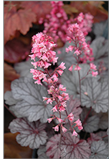
Milan Coral Bells flowers

Milan Coral Bells is recommended for the following landscape applications;