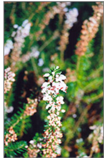
Scotch Heather flowers