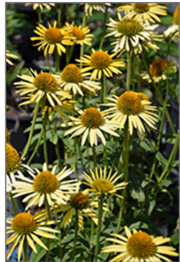
Maui Sunshine Coneflower flowers