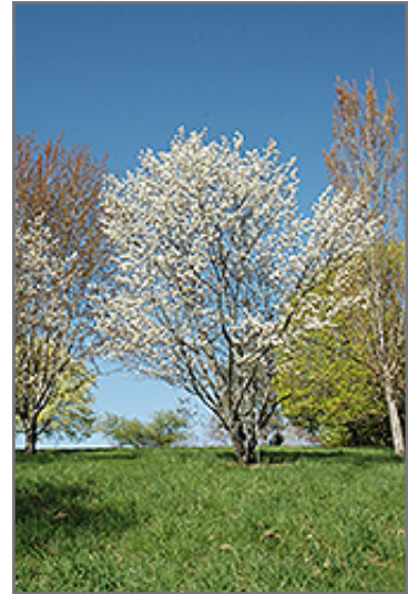
Princess Diana Serviceberry in bloom