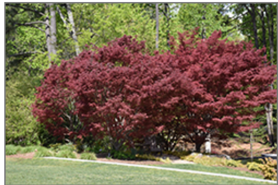
Suminagashi Japanese Maple