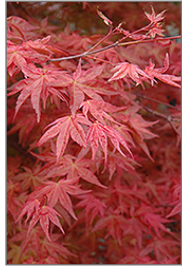
Suminagashi Japanese Maple foliage

This tree does best in full sun to partial shade. You may want to keep it away from hot, dry locations that receive direct afternoon sun or which get reflected sunlight, such as against the south side of a white wall. It prefers to grow in average to moist conditions, and shouldn't be allowed to dry out. It is not particular as to soil pH, but grows best in rich soils. It is somewhat tolerant of urban pollution, and will benefit from being planted in a relatively sheltered location. Consider applying a thick mulch around the root zone in winter to protect it in exposed locations or colder microclimates. This is a selected variety of a species not originally from North America.