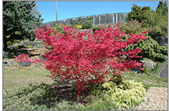
Shindeshojo Japanese Maple in spring

This tree does best in full sun to partial shade. You may want to keep it away from hot, dry locations that receive direct afternoon sun or which get reflected sunlight, such as against the south side of a white wall. It prefers to grow in average to moist conditions, and shouldn't be allowed to dry out. It is not particular as to soil pH, but grows best in rich soils. It is somewhat tolerant of urban pollution, and will benefit from being planted in a relatively sheltered location. Consider applying a thick mulch around the root zone in winter to protect it in exposed locations or colder microclimates. This is a selected variety of a species not originally from North America.