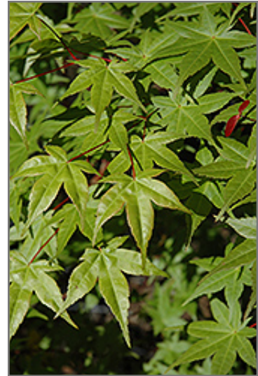
Shindeshojo Japanese Maple foliage

Shindeshojo Japanese Maple is recommended for the following landscape applications;