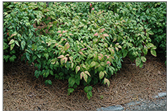
Fire Power Nandina