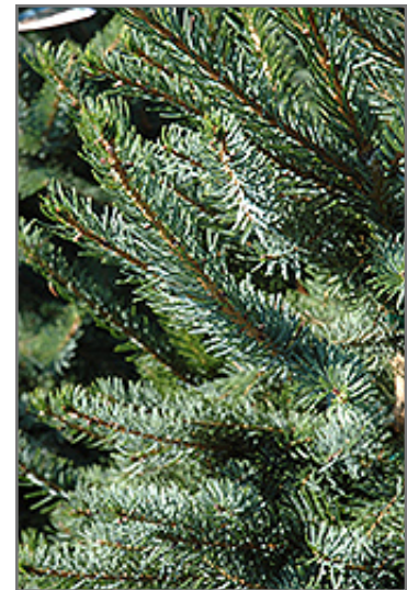
Bruns Spruce foliage