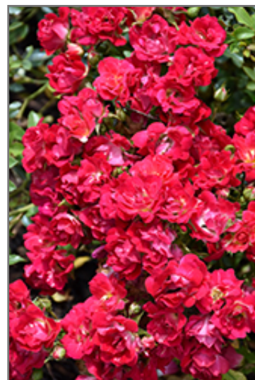
Red Drift Rose flowers

Red Drift Rose is recommended for the following landscape applications;