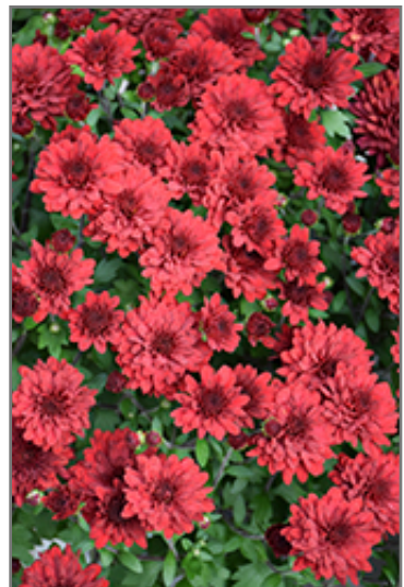
Five Alarm Red Chrysanthemum flowers