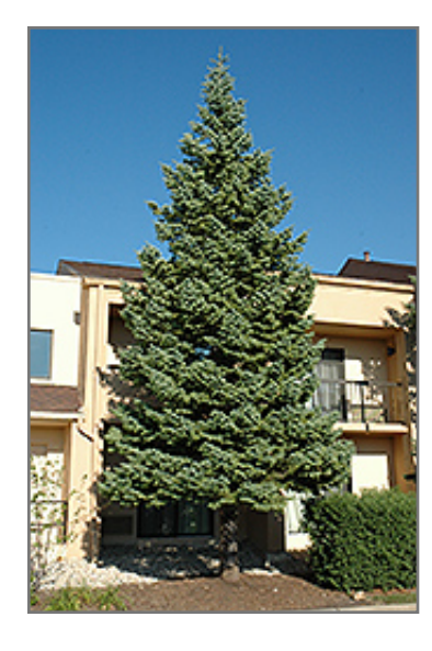
White Fir