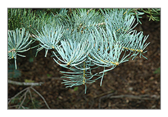
White Fir foliage