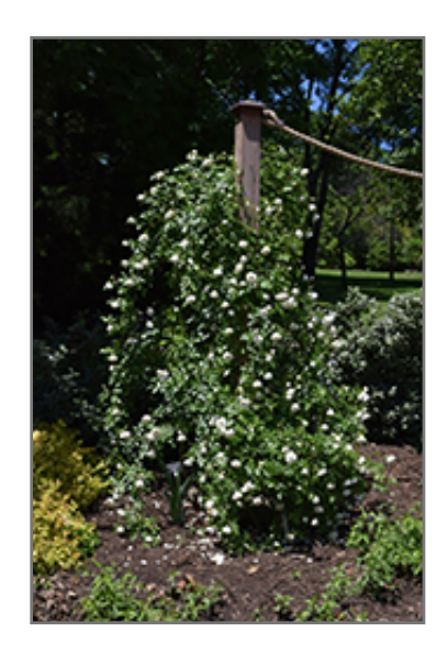
Iceberg Rose in bloom

8424 Farley St. Overland Park, KS 66212 913.642.6503