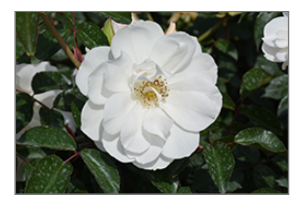
Iceberg Rose flowers

Iceberg Rose is recommended for the following landscape applications;