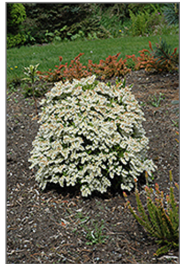
Prelude Japanese Pieris in bloom