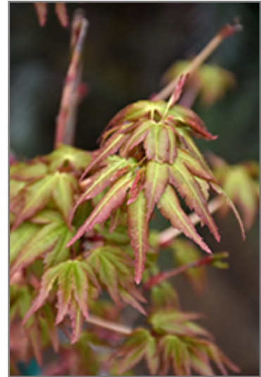
Bihou Japanese Maple foliage