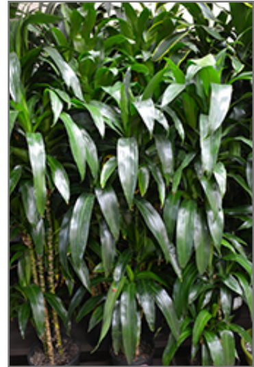
Lisa Dracaena foliage

When grown indoors, Lisa Dracaena can be expected to grow to be about 5 feet tall at maturity, with a spread of 24 inches. It grows at a medium rate, and under ideal conditions can be expected to live for approximately 10 years. This houseplant performs well in both bright or indirect sunlight and strong artificial light, and can therefore be situated in almost any well-lit room or location. It does best in average to evenly moist soil, but will not tolerate standing water. The surface of the soil shouldn't be allowed to dry out completely, and so you should expect to water this plant once and possibly even twice each week. Be aware that your particular watering schedule may vary depending on its location in the room, the pot size, plant size and other conditions; if in doubt, ask one of our experts in the store for advice. It will benefit from a regular feeding with a general-purpose fertilizer with every second or third watering. It is not particular as to soil type or pH; an average potting soil should work just fine.