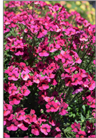
Nesia Magenta Nemesia flowers