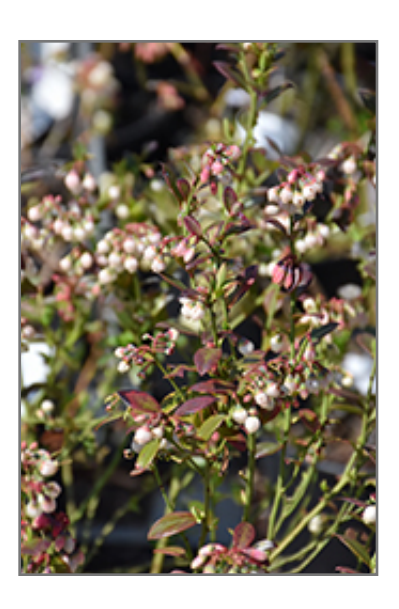
Buckle Blueberry flowers

This is a multi-stemmed evergreen shrub with a mounded form. Its average texture blends into the landscape, but can be balanced by one or two finer or coarser trees or shrubs for an effective composition. This is a relatively low maintenance plant, and usually looks its best without pruning, although it will tolerate pruning. It is a good choice for attracting birds to your yard. It has no significant negative characteristics.