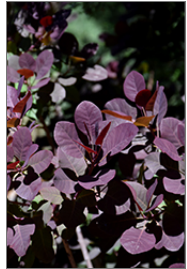
Lilla Smokebush foliage

This shrub should only be grown in full sunlight. It is very adaptable to both dry and moist locations, and should do just fine under average home landscape conditions. It is not particular as to soil type or pH. It is highly tolerant of urban pollution and will even thrive in inner city environments, and will benefit from being planted in a relatively sheltered location. This is a selected variety of a species not originally from North America.