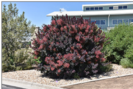
Lilla Smokebush in bloom

Lilla Smokebush is recommended for the following landscape applications;