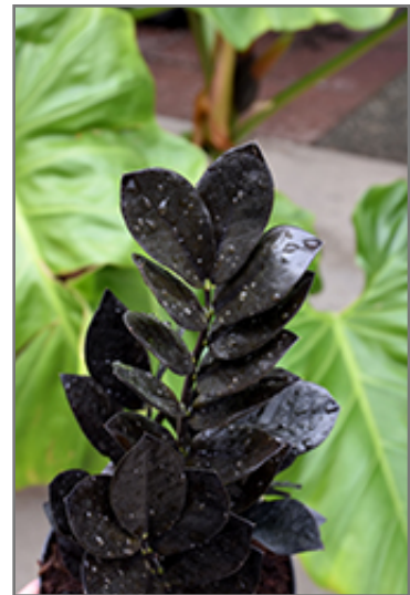
Raven ZZ Plant flowers