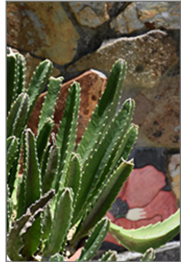
Zulu Giant