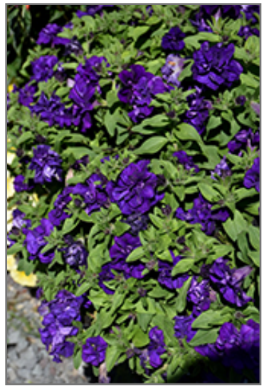
Vogue Blue Double Petunia flowers

8424 Farley St. Overland Park, KS 66212 913.642.6503