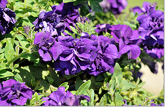
Vogue Blue Double Petunia flowers