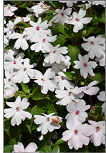
Solarscape White Shimmer Impatiens flowers

Solarscape White Shimmer Impatiens is recommended for the following landscape applications;