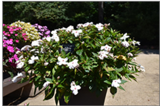
Solarscape White Shimmer Impatiens in bloom

Solarscape White Shimmer Impatiens will grow to be about 9 inches tall at maturity, with a spread of 20 inches. When grown in masses or used as a bedding plant, individual plants should be spaced approximately 14 inches apart. Its foliage tends to remain low and dense right to the ground. This fast-growing annual will normally live for one full growing season, needing replacement the following year.