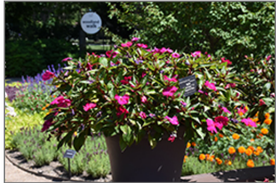
Solarscape Magenta Bliss Impatiens in bloom

Solarscape Magenta Bliss Impatiens will grow to be about 9 inches tall at maturity, with a spread of 20 inches. When grown in masses or used as a bedding plant, individual plants should be spaced approximately 14 inches apart. Its foliage tends to remain low and dense right to the ground. This fast-growing annual will normally live for one full growing season, needing replacement the following year.