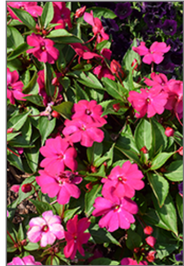
Solarscape Magenta Bliss Impatiens flowers

Solarscape Magenta Bliss Impatiens is recommended for the following landscape applications;