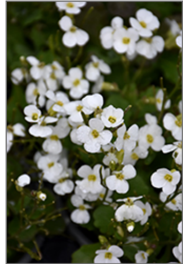
Catwalk White Wall Cress flowers

Catwalk White Wall Cress is recommended for the following landscape applications;