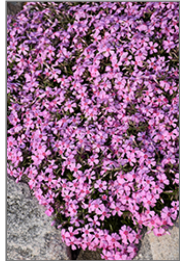
Eye Candy Creeping Phlox in bloom

Eye Candy Creeping Phlox is recommended for the following landscape applications;