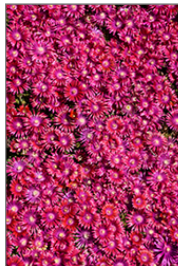
Granita Raspberry Ice Plant in bloom

Granita Raspberry Ice Plant is recommended for the following landscape applications;